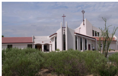
East Mesa Campus

Registration forms are available at each campus and at www.oursaviorslutheran.org